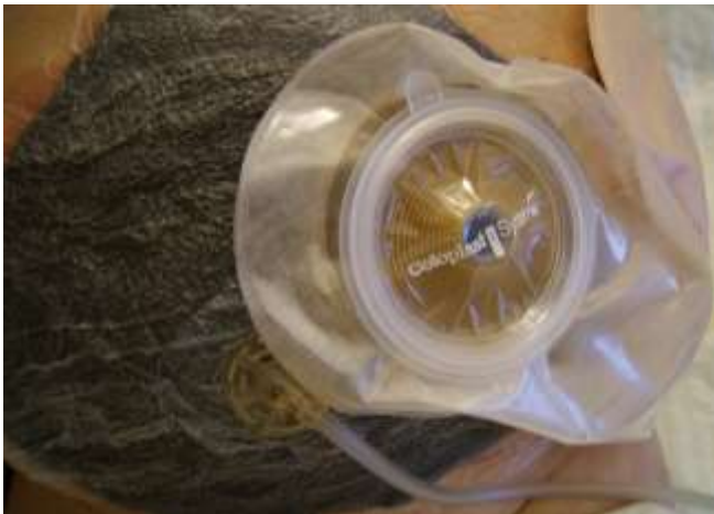
Fig. 8. Complete dressing after activation of negative pressure wound therapy