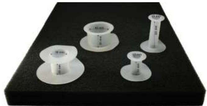
Fig. 1. Four available versions of the PPM-fistula adapter™-set (Fa. Phametra, Pharma & Medica-Trading GmbH, Herne/Ruhrstadt, Germany)

Keywords — enteroatmospheric fistula, intestinal fistula, negative pressure wound therapy, open abdomen, vacuum therapy.