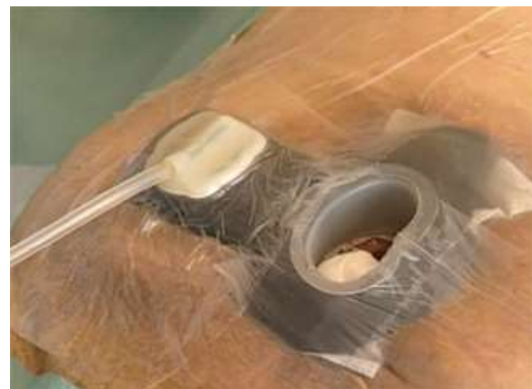
Fig. 6. Fixed suction pad