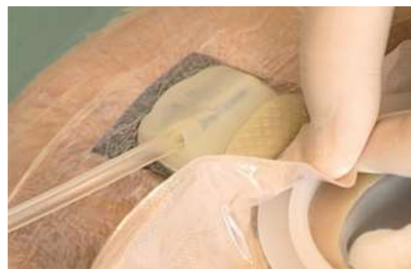
Fig. 7. Fixed ostomy bag after activating negative pressure wound therapy