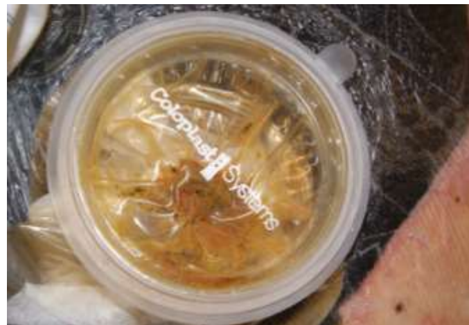
Fig. 10. Ostomy bag filled with stools while the foam remains clean

In a next step the suction pad is fixed. Afterwards the appliance can be put above the adapter after incision of the foil covering the FA. Then NPWT is activated. By this the FA is reliably fixed to the wound surface (fig. 8). According to the wound conditions a negative pressure of 75 to 125 mmHg should be used. To check the wound dressing we first look at the foam. It has to be contracted at all areas. To functionally control leak tightness we open the two-pieces appliance. If the foam remains contracted, we have proven leak tightness of the system (fig. 9). If the ostomy bag is filled with fluid or stool it can be emptied at any time or continuously via drain (fig. 10).