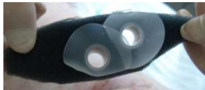
Fig. 2. Two fistula adapters inserted in a foam, the lower brim is cut to match the outline of the foam

THE introduction of negative pressure wound therapy (NPWT) has improved the treatment of an open abdomen in many ways. 1,2,3 However, enteroatmospheric fistulae (EAF) remain a serious problem. NPWT, applied via foam to the wound surface, often leads to enlargement of the fistula or excrescence of the bowel mucosa. Additionally, viscous stool might obstruct the foam. This results in a separation of the foam from the wound surface. The suction starts to leak and this may lead to contamination or infection of the wound. Several drain-out systems using NPWT have been published. 4,5 Unfortunately none of them could completely solve this problem. In most cases individual, time-consuming modifications of the wound dressing are necessary to avoid fistulas and obstruction of NPWT devices. In a first publication in 2011 we introduced the fistula adapter (FA) for treatment of EAF. 6 Since then three new modifications have been developed to overcome some of the experienced problems. In this work we introduce these strategies.