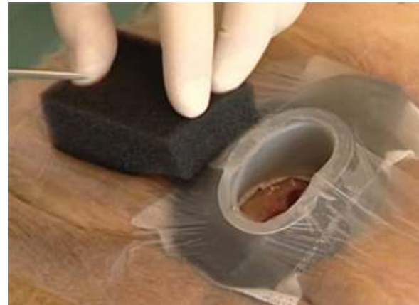
Fig. 5. Small foam for an air-bridge

In case of a small wound area the suction pad cannot be placed directly beside the ostomy base plate. We therefore build a so called air-bridge. In this area the foil is already covering the skin, so there is no direct contact between foam and skin. This second small foam also has to be covered by a foil (fig. 5-7).