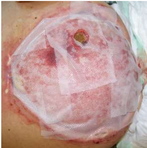
Fig. 3 Silicon gauze covering the wound surface with exception of the fistula